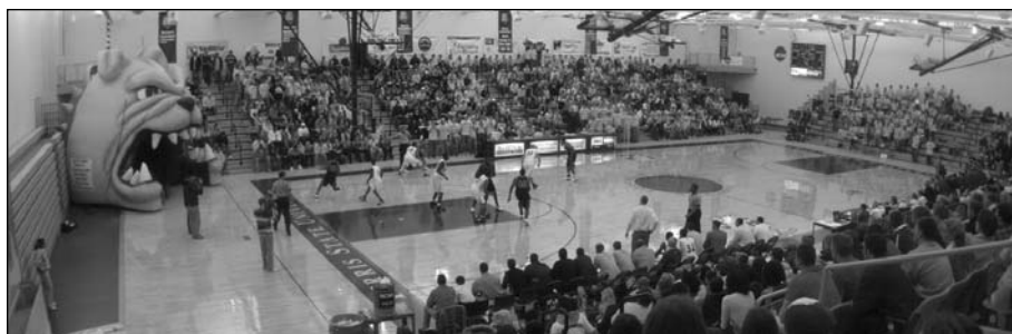
The Ferris State men's basketball program played its home games at Old Jim Wink Arena (top photo) in the Health and Physical Education Building from 1963-98. The Bulldogs compiled an impressive 304-89 (.707) record on the court and won 10 or more home games in a season 15 times. The new Jim Wink Arena is shown in the bottom photo.