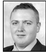
ROB BENTLEY Athletics Communications