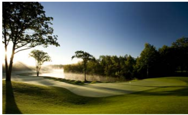
"2007 Top 15 greatest public courses in America" Golf Digest 2007