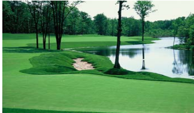
"They are the elite, the ultimate experience, the very best golf that our part of the world has to offer" - Golf Digest