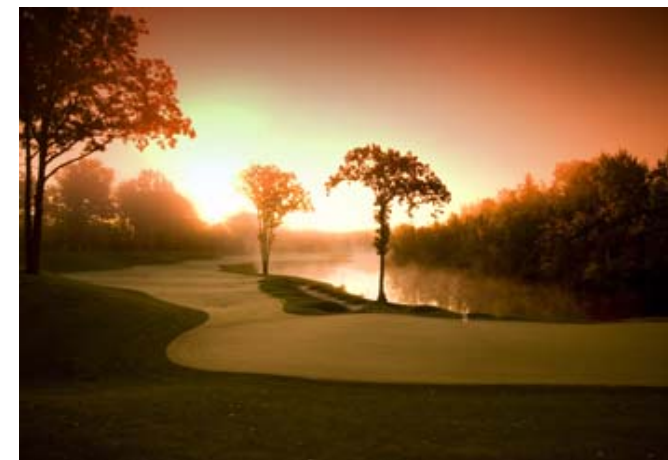
"Tullymore is a bedazzling golf course, a unique style of golf design that's imposed upon the landscape without being an imposition."