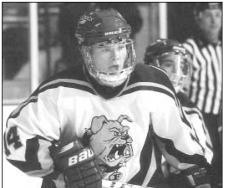
Chris Kunitz was Ferris State's 2000-01 recipient of the inaugural Michigan College Hockey.com Breakaway Player of the Year Award. He totaled 29 points last year for the second consecutive season.