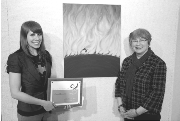
Honors Art Show