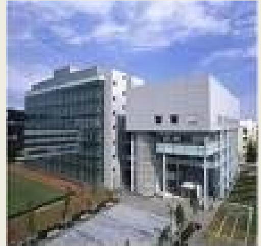
Boehringer Ingelheim is a pharmaceutical giant in Germany