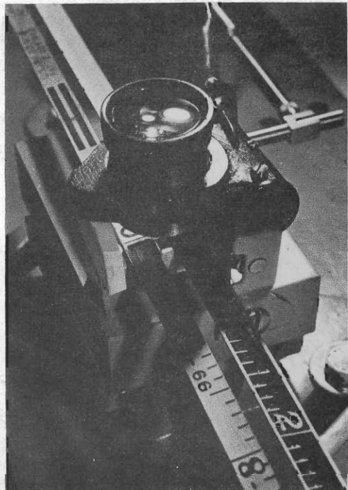
FIGURE 3. A view of two tapes located on the supporting roller bearings on the movable carriage. An observer views the two tapes located on either side of the index mark with the magnifying glass.

per 100,000 per hundred feet and a standard deviation of \sigma_{NBS} = 0.003 in. (0.0003 ft.). Based upon experience with the chapter's comparing device, standard deviations of the same magnitude as those claimed by the Na-