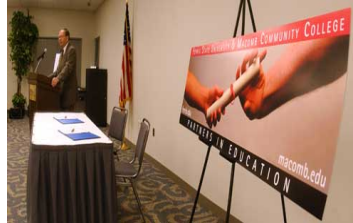
Ferris State University and Macomb County Community College become educational partners