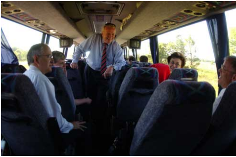
On The Road Again