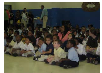
Reading day kicked off with an assembly