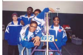
Team Members Put "Boxing Bot" Through Its Paces