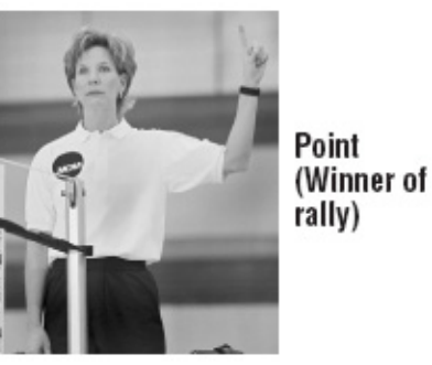
Indicate point to side w/ pt.