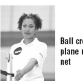
Ball crossing plane under