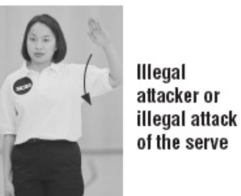
Indicate side at fault