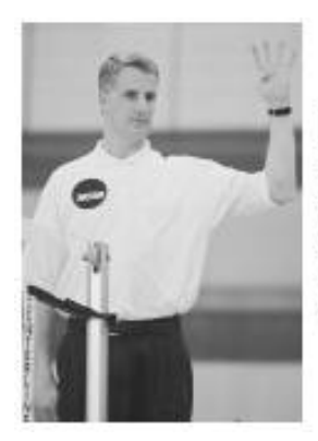
Ball contacted more than three times by a team

A team may only touch a ball three times before returning it to the opposing team. Once the ball touches a player on one team for the fourth time without being returned, a 4 hits violation is called. Note that an attempted block does not count as one of a team's three hits. CoRec, if three hits are used; a female must be involved in one of the hits.