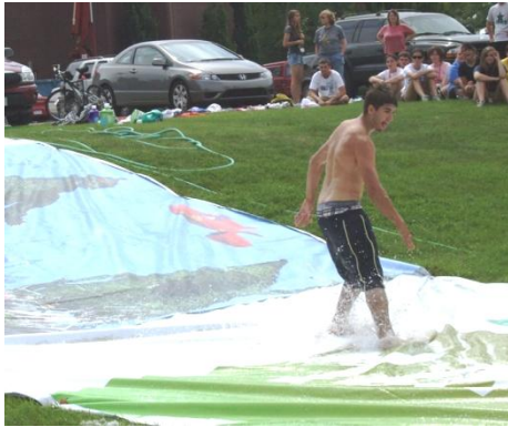
Slip-n-Slide, Welcome Week