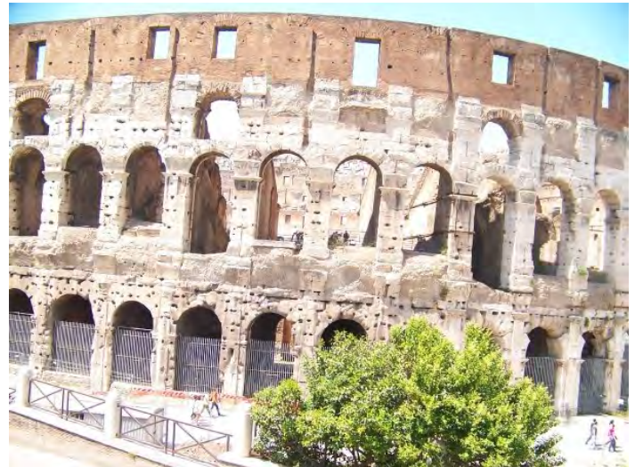
Sightseeing in Rome

Some parts of traveling abroad are planned and some parts are not. One of