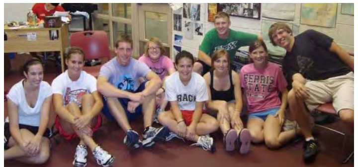
Peer mentor group from Fall 2009 enjoying a day rock climbing at the student recreation center on campus