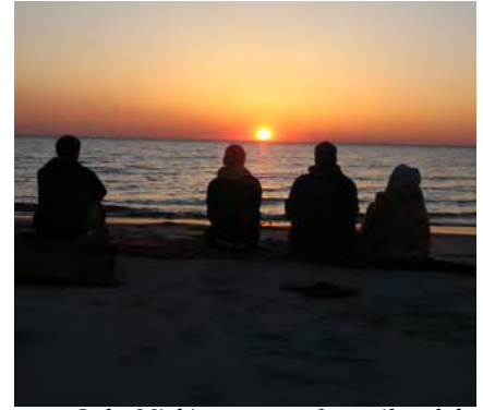
Lake Michigan sunset from silver lake sand dunes

Big Rapids is also home to many hidden treasures, such as the old mill run pond near Tioga which is excellent for fishing, the cliffs overlooking the winding Muskegon River, the sand dunes, and hiking trails tucked behind the city pool.