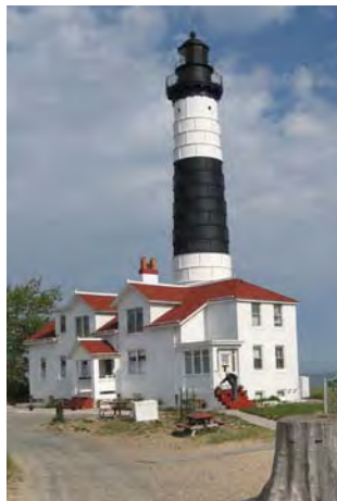
Big Sable Point Lighthouse in Ludington State Park