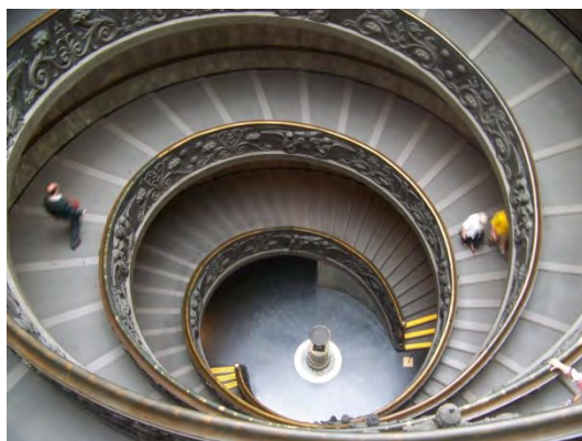
An inside view of the Vatican

For more information about the programs that are available contact the Study Away Office at (231) 591-2451 or studyabroad@ferris.edu .