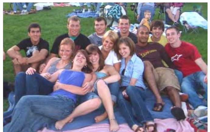
Students enjoy 4th of July fireworks in Bay City

This is only a small recording of some of the activities available to a student who chooses to reside in Big Rapids. Each weekend or potentially boring evening was somehow filled with a random activity that helped entertain us for the time being. So when it comes time to think about summer classes, whether it's to improve grades, get ahead in class, or because it's required don't fear that the season will be boring and dry.